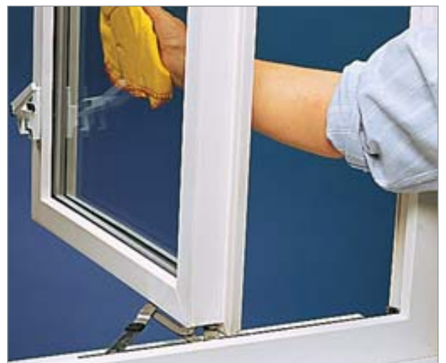
ABOVE: With the Nico Easy Clean Egress Hinge, cleaning the outside of windows is much safer and easier, with no awkward catches or buttons.