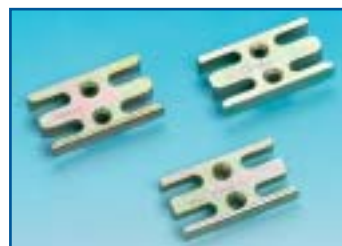
Keeps are common to Security Plus Shootbolts and Espagnolette Bolts.

Secure keeps to frame and adjust eccentric cams if necessary.