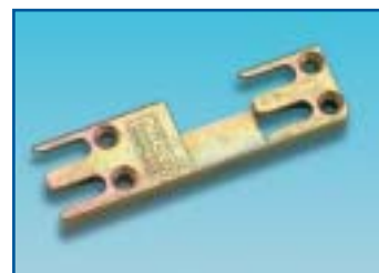
Optional double keeps are available for some systems.