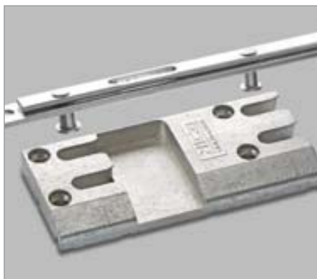
ABOVE: Robust profile specific keeps with four fixing holes provide extra strength and security.

A quality build and robust profile-specific keeps combine to ensure a long reliable life and light, smooth closing action. Plus, the attractive Supercoat 500 silver finish provides excellent corrosion protection.