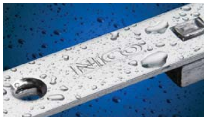
RIGHT: Nico Supercoat 500 is a special corrosion resistant coating. Test Results indicate that finished products have achieved grade 5 (exceptionally high resistance to corrosion) as defined in BS EN 1670:2007, making them suitable for environments subject to industrial or coastal pollution plant.