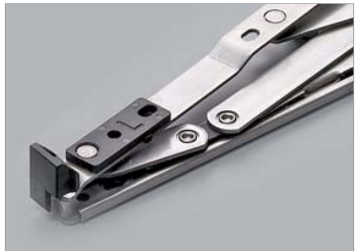
Nico Security Plus Hinge in 17mm high stack version.