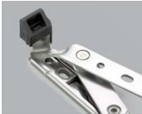
The nosecap is designed to resist forced entry.

The Nico Security Plus Hinge features a unique patented design for added strength, with a hooked nose bar and free moving nose cap that are designed to lock together when forced entry is attempted.