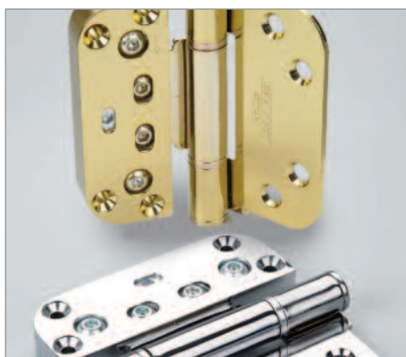
TOP: 4915 3D Adjustable Door Hinges in (left to right) white powder coating, Supercoat 500 and yellow zinc.