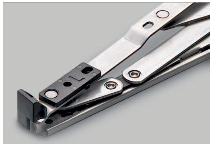
Nico Security Plus Hinge in 17mm high stack version.

The Security Plus Hinge has been endurance tested to 30,000 cycles in the Nico Test Centre.