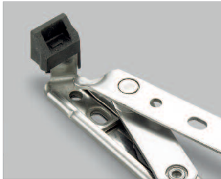
The nosecap is designed to resist forced entry.

The Nico Security Plus Hinge features a unique patented design for added strength, with a hooked nose bar and free moving nose cap that are designed to lock together when forced entry is attempted.