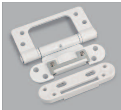
ABOVE: Icon Hinge showing separate injection-moulded spacer plate.

Nico has continuously manufactured door hinges in the UK for over 80 years, and passionately strives to produce products that meet and exceed customer needs.