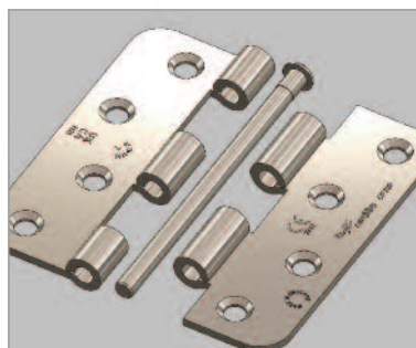
Nico 4515 Loose Pin Hinge.