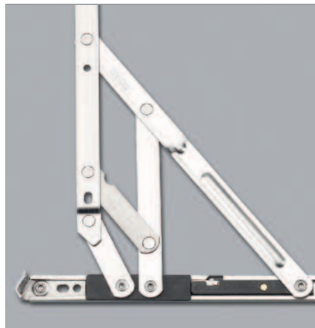
ABOVE: With the Nico Egress Easy Clean Variant Hinge, cleaning the outside of windows is much safer and easier, with no awkward catches or buttons.

The Hinges comply with Building Regulations Part B (Egress variant), BS9991:2015 (Egress variant) and BS8213-1:2004 (Easy Clean variant). They have also been endurance tested in the Nico Test Centre with their maximum load carrying capacity over 30,000 cycles.