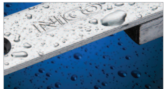
ABOVE: Nico Supercoat 500 is a special corrosion resistant coating. Test Results indicate that finished products have achieved grade 5 (exceptionally high resistance to corrosion) as defined in BS EN 1670:2007, making them suitable for coastal or industrial environments.

Nico MK1 gearboxes are endurance tested over 30,000 cycles, and the eccentric 9mm cams on the extensions allow weatherseal adjustment of +/- 1mm. What is more the attractive Supercoat 500 silver finish provides excellent corrosion resistance.