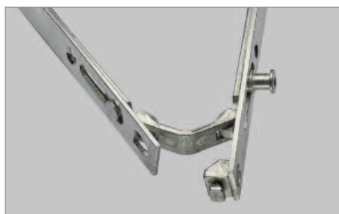
ABOVE: Wrap around corner detail.

It connects to Nico MK 1 shootbolt gearboxes, and has a 400mm return which travels around the corner of the sash rebate and gives an extra locking point. It does not require any routing of the corner with a standard eurogroove depth, and gives extra window compression when a night vent facility is not required.