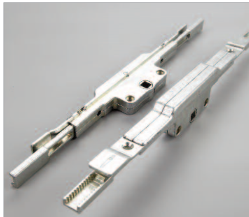
ABOVE: Nico Mk1 Shootbolt Gearbox.

Nico Wrap Around Gearing is fast and easy to use, providing additional mushroom cam locking points for windows.